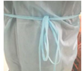
WAIST - BACK VIEW