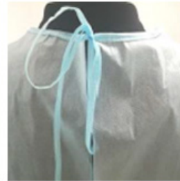
NECK - BACK VIEW