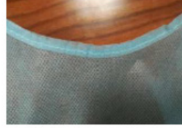
NECK - FRONT VIEW