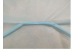
WAIST - FRONT VIEW